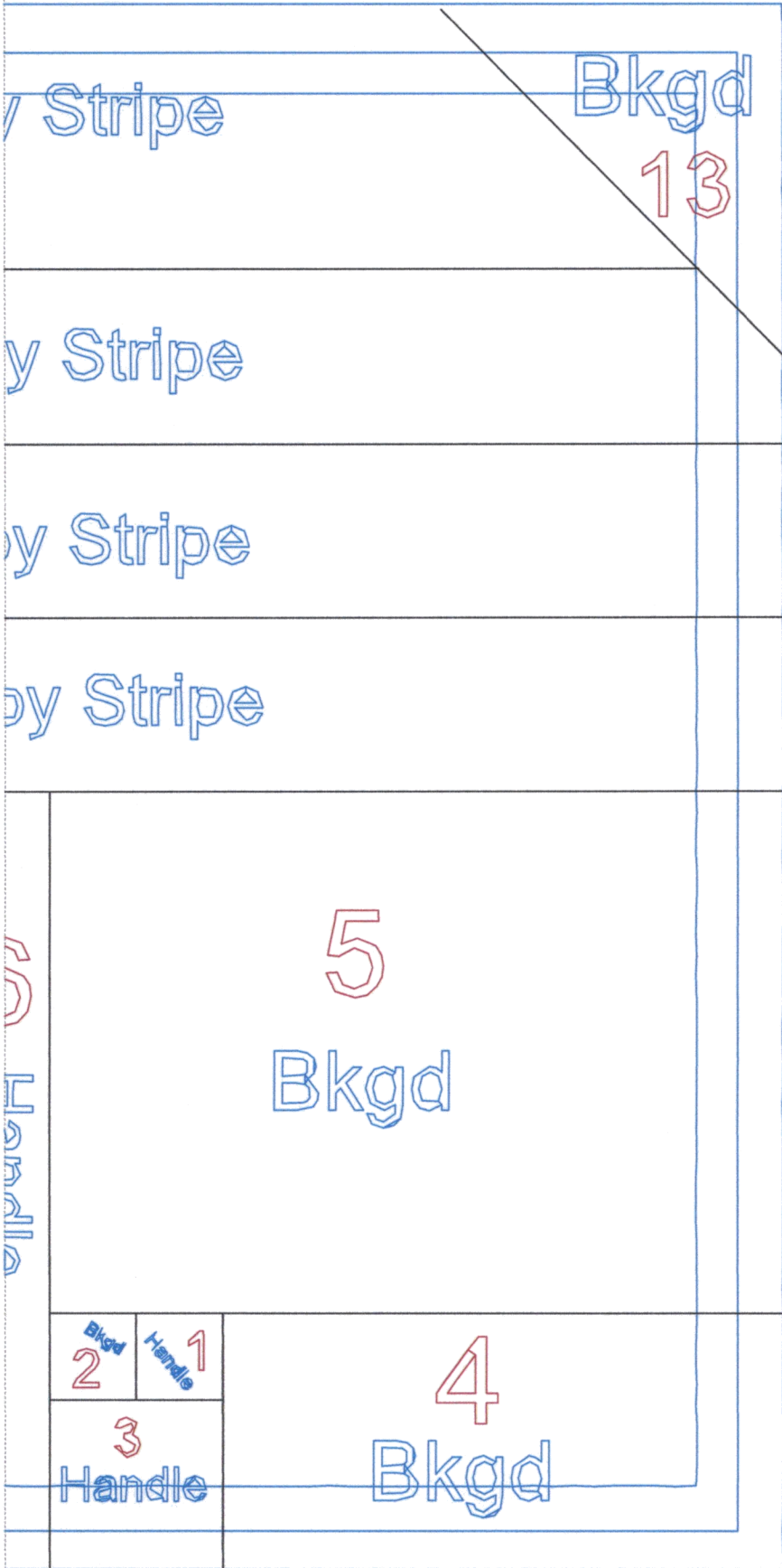
Umbrella — Second Page