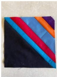
Step 5 before the final corner.

Step 5: Trim as you go, if you like. After a few strings are added, square off by aligning the bottom black corner of the foundation triangle. An 8" square ruler helps but not necessary. This first trim makes it easier to see how long the next strings will be. They will get shorter as you approach the final corner. **NOTE: The UPPER LEFT corner will lie somewhere in your strips, not on the original black triangle.