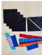
Step 1 and prep